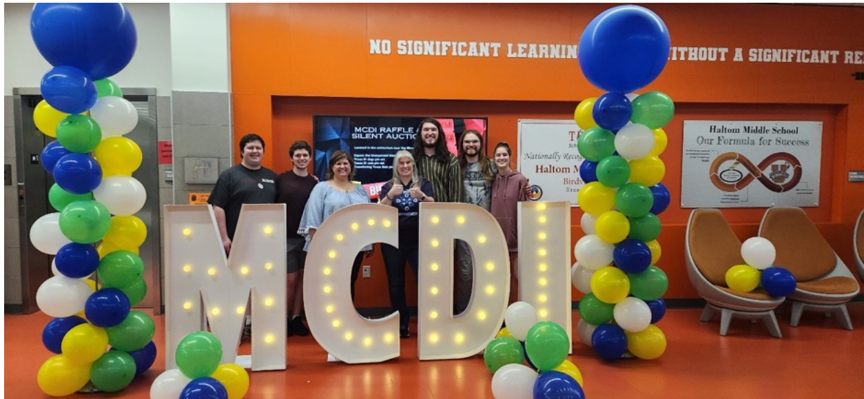
Photo op at the tournament.