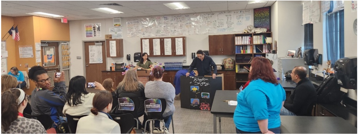
Examples of possible Presentation Sites.