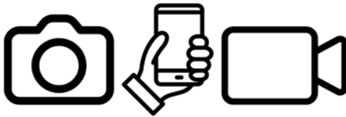
Image description: Three black and white pictograms of a camera, cell phone camera, and a video camera.

Photos/videos of a team’s Presentation may only be taken if the team has given permission. This information will be announced before the team begins its