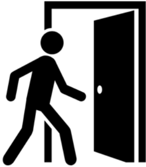
Image description: A black and white pictogram of a figure walking through an open door.

Entrances to the tournament can be found on the site map on our website's tournament page .