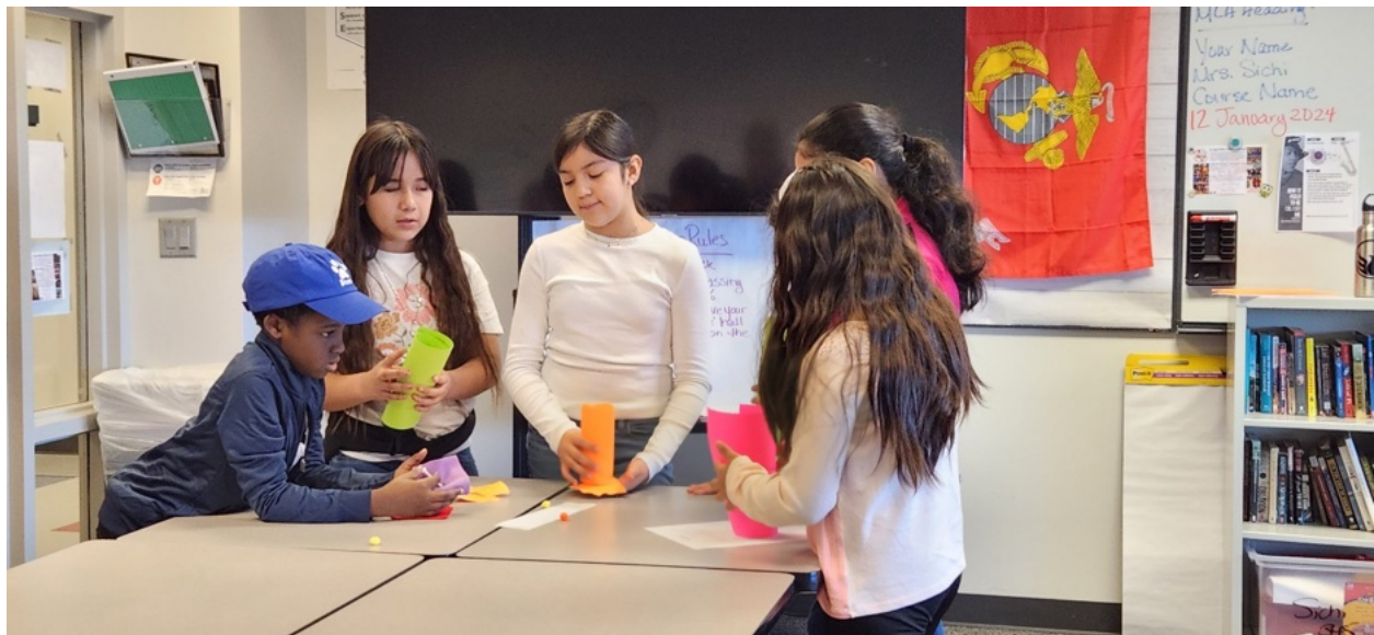
Example of an IC space.

When a team has completed the Instant Challenge, the team members may be directed to a Cool Down room to discuss the experience with one another. Since many teams will utilize the same Instant Challenge at this event, teams must not discuss details of the Instant Challenge outside of the Cool Down room until after the Destination Imagination season has ended in May.