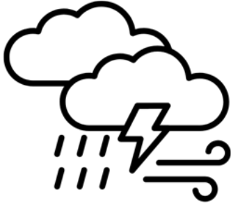
Image description: A black and white pictogram of storm clouds with lightning, rain, and wind.

If inclement weather will have any impact on the tournament schedule, teams will be notified via Remind. The forecast is clear, low 46 high 81. Dress accordingly.