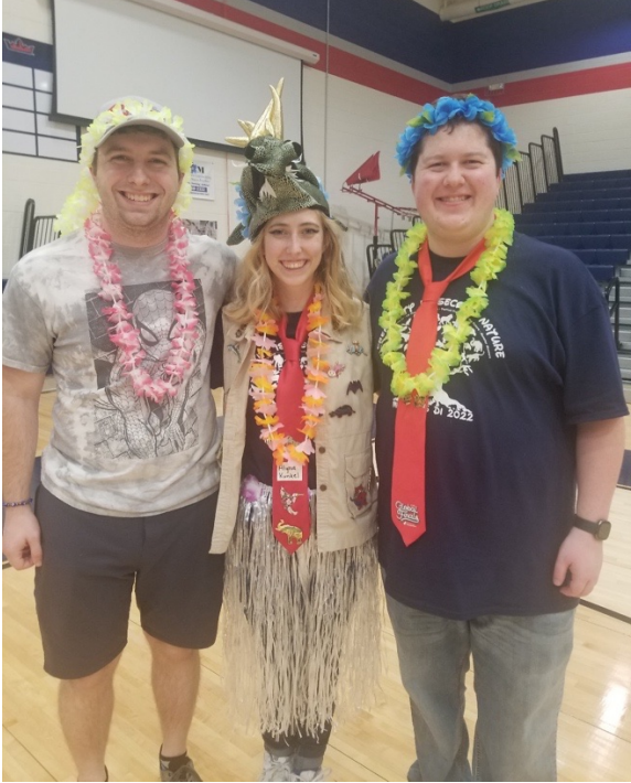
Volunteers in silly hats and costumes for a Hawaiian theme.