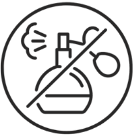
Image description: A black and white pictogram of a perfume bottle that has been crossed out.

Out of respect to those with sensitivity to scent, please avoid wearing perfumes or colognes.