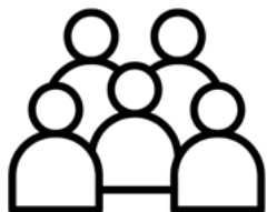
Image description: A black and white pictogram of people seated in an audience.

Spectators, such as friends and family members, are welcome to attend this tournament. Spectators are welcome to attend any Team Challenge presentation. Please find the doors marked “Audience Entrance” at each Challenge Presentation Site.