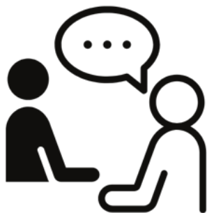
Image description: A black and white pictogram of two figures having a conversation. A speech bubble above them reads "...".

The Awards Celebration will be presented in English. Most Team Presentations will be shared in English. Signage throughout the event will be available in English and Spanish.