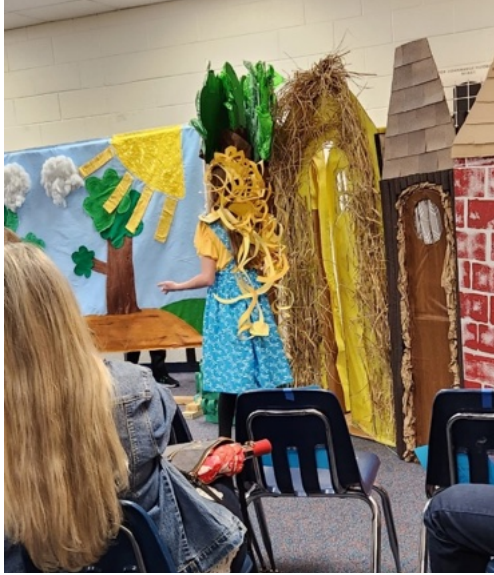
Team members in costume.