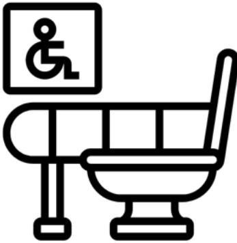
Image description: A black and white pictogram of a toilet with a grab bar. Above it, the symbol for accessibility is displayed on the wall.

Restrooms divided by gender can be found in the following locations: throughout the site in all hallways and junctures.