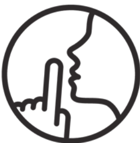
Image description: A black and white pictogram showing a face in profile. One finger is raised toward the lips to make the “Shhh” gesture.

A Quiet Room/Regulation Room is available upon request. This space is reserved for attendees who may need a quiet space for tasks like taking medication, prayer, addressing sensory needs, or just a moment away from the busy tournament! Find a volunteer in purple polos to help you.