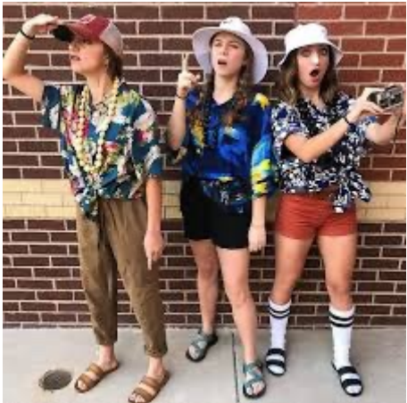
Example of tacky tourists.

This year our theme is "Tacky Tourist." Please wear your Hawaiian shirts, cameras, socks with sandals, and anything else you think will make you a Tacky Tourist.