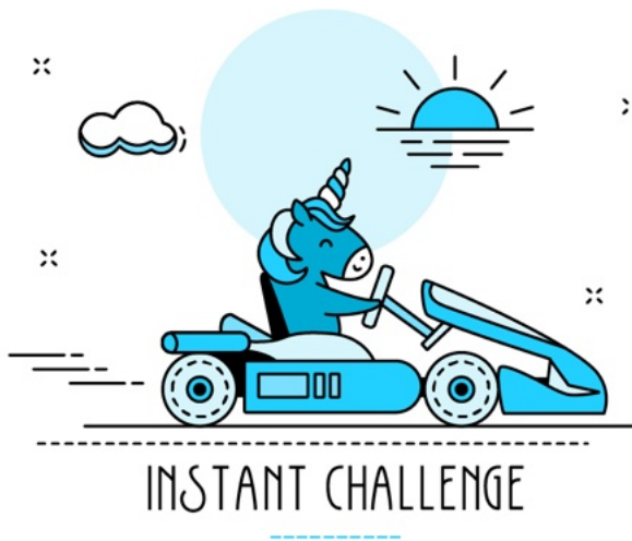
Image Description: The Instant Challenge logo for the 2024-25 season; in hand drawn art, a light blue unicorn drives a go-cart on a sunny day.

An Instant Challenge (IC) is a smaller Challenge that is a surprise to the team on the day of the tournament. An Instant Challenge may involve a task, a performance, or a combination of both. Instant Challenges usually last ten minutes or less.