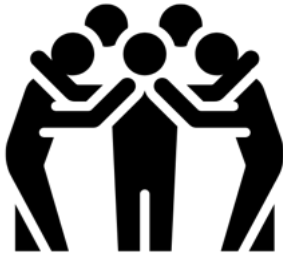
Image description: A black and white pictogram of a team in a huddle formation.

Throughout the event, Destination Imagination (DI) teams will be presenting their work on a Team Challenge . The Team Challenge falls in one of seven categories: Technical, Scientific, Fine Arts, Improvisational, Engineering, Service Learning, or Early Learning. You can learn more about this year's Team Challenges on the DI website . Each Team Challenge has its own Presentation Site, or rooms specific to the