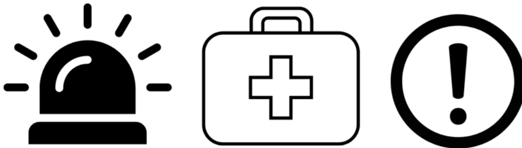
Image description: black and white pictograms of an alarm light, first aid kit, and an alert sign with an exclamation point.

The fire alarms in the building have flashing lights and loud repetitive sirens. If the need for an evacuation arises, please follow posted exit signage to safety.