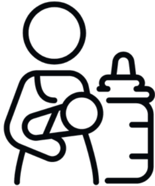
Image description: A black and white pictogram of a parent holding an infant alongside a bottle.

A private space exclusively for nursing parents can be arranged if needed.