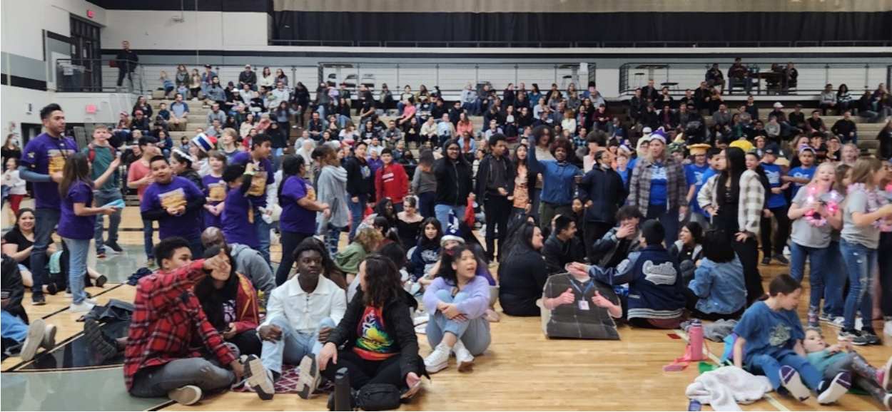
A photo of the crowd from a previous Awards Celebration.