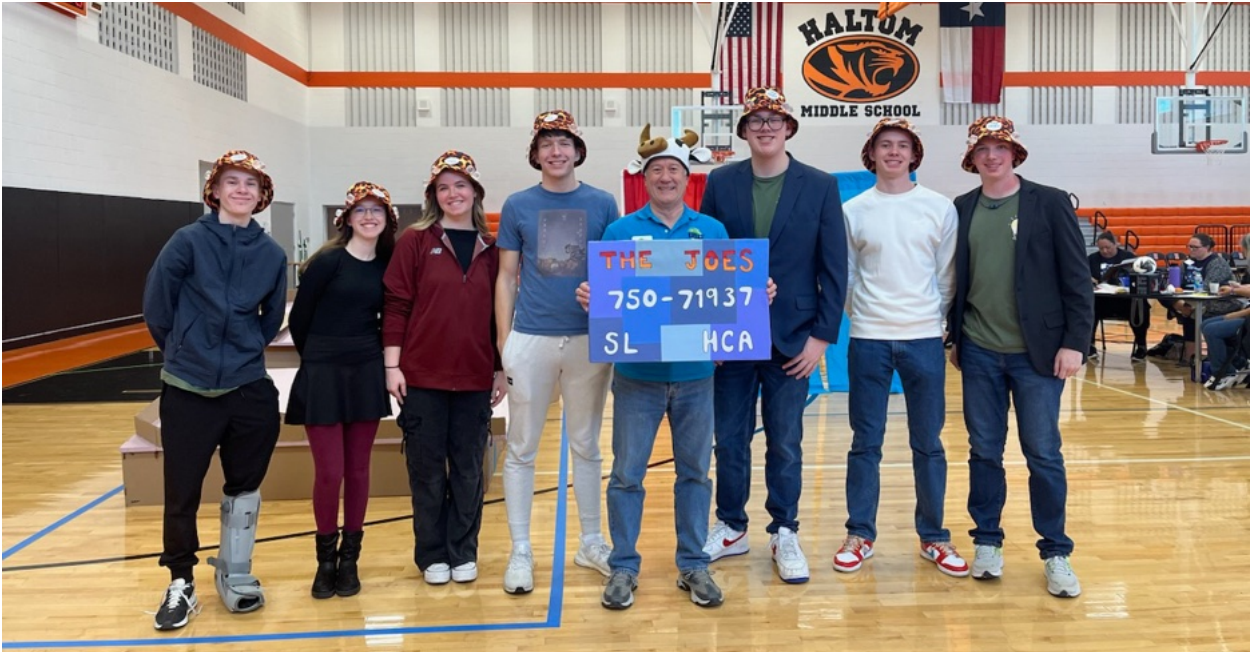
A team wearing silly hats.

If you are a person who prefers using protective equipment such as ear defenders, ear plugs, etc., it will be helpful for you to bring them with you to the event.