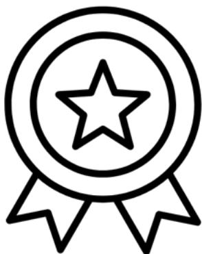
Image description: A black and white pictogram of a medal with a star in its center.

The Awards Celebration will take place Saturday, February 8, 2025, at 7:00 PM in the main gym at North Richland Middle School, located at 4801 Redondo Street, North Richland Hills, TX 76180. All teams and spectators are welcome to attend. Teams and Team Managers should sit on the floor of the gym and spectators should sit in the stands. Doors open at 6:30 PM.