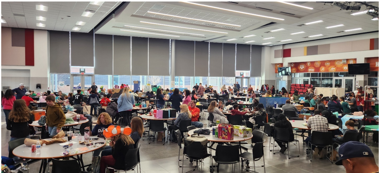
Picture of a sample dining area.

Teams and spectators are welcome to bring their own food and drinks. We ask that you enjoy your food and drinks in Cafeteria.