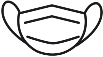
Image description: A black and white pictogram of a protective face covering.

Our event will adhere to local health and safety restrictions. At this time, masking and vaccinations are optional.