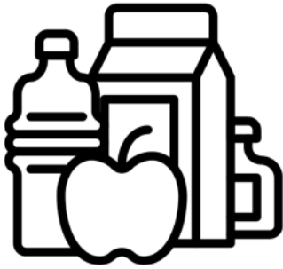
Image description: Black and white pictograms of food and drink such as an apple, water bottle, and milk carton.

Food and drinks will be available during the tournament at the concession stand located outside the main gym. The cost of most items ranges from $1.00- $.3.00 Link to the menu.